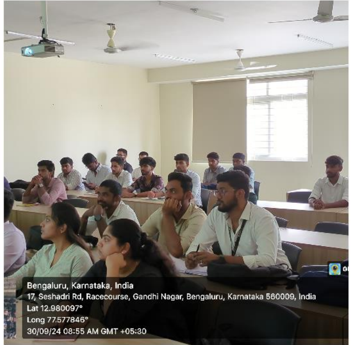
Bengaluru, Karnataka, India 17, Seshadri Rd, Racecourse, Gandhi Nagar, Bengaluru, Karnataka 560009, India Lat 12.980097° Long 77.577846° 30/09/24 08:55 AM GMT +05:30