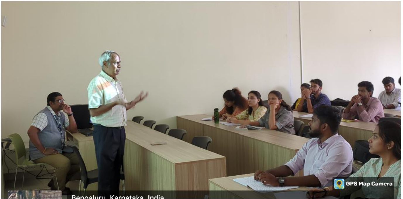
Bengaluru, Karnataka, India